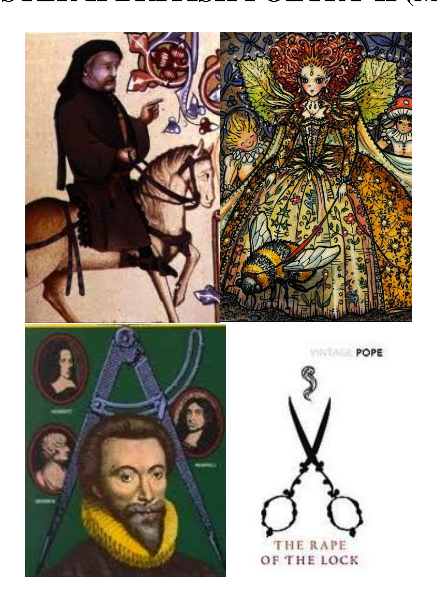
SCHOOL OF HUMANITIES UTTARAKHAND OPEN UNIVERSITY