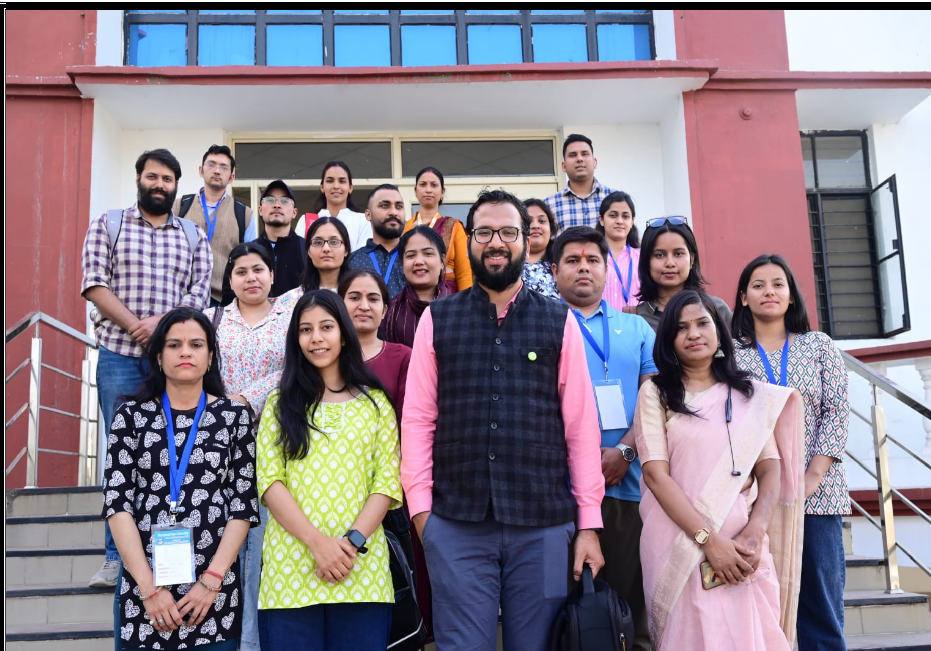
Group Photograph of Day 3 rd (26 th March-2025)