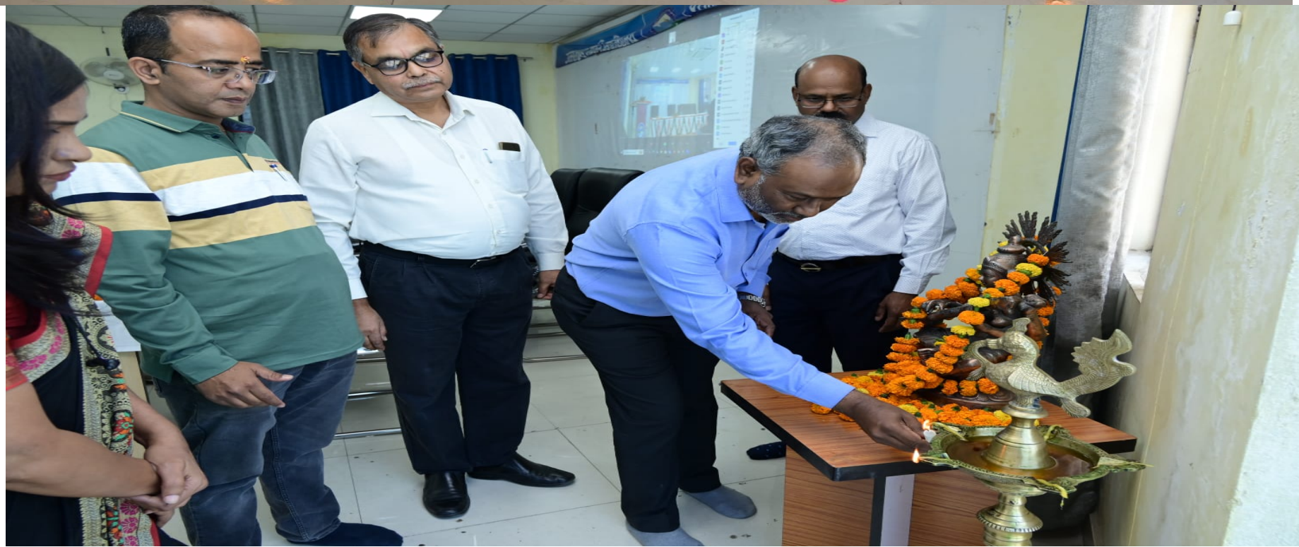
Inauguration of FDP (24-29 th March-2025)